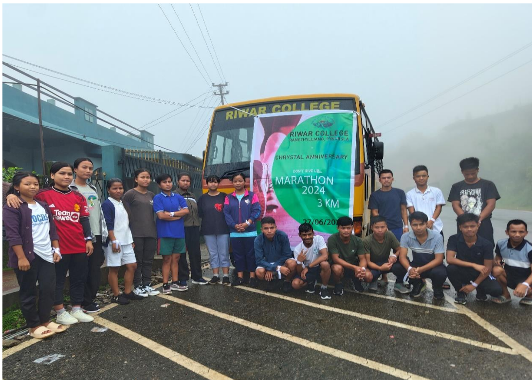
Celebration of 15 th Anniversary Foundation Day