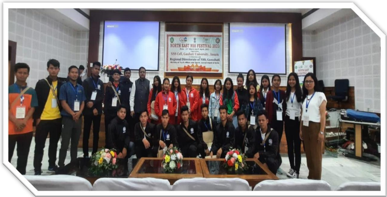
Participated in the NSS Festival, Gauhati University