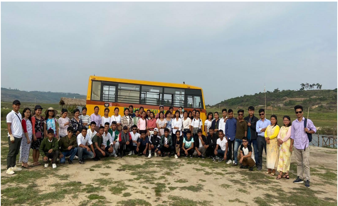
Farewell Picnic 2023